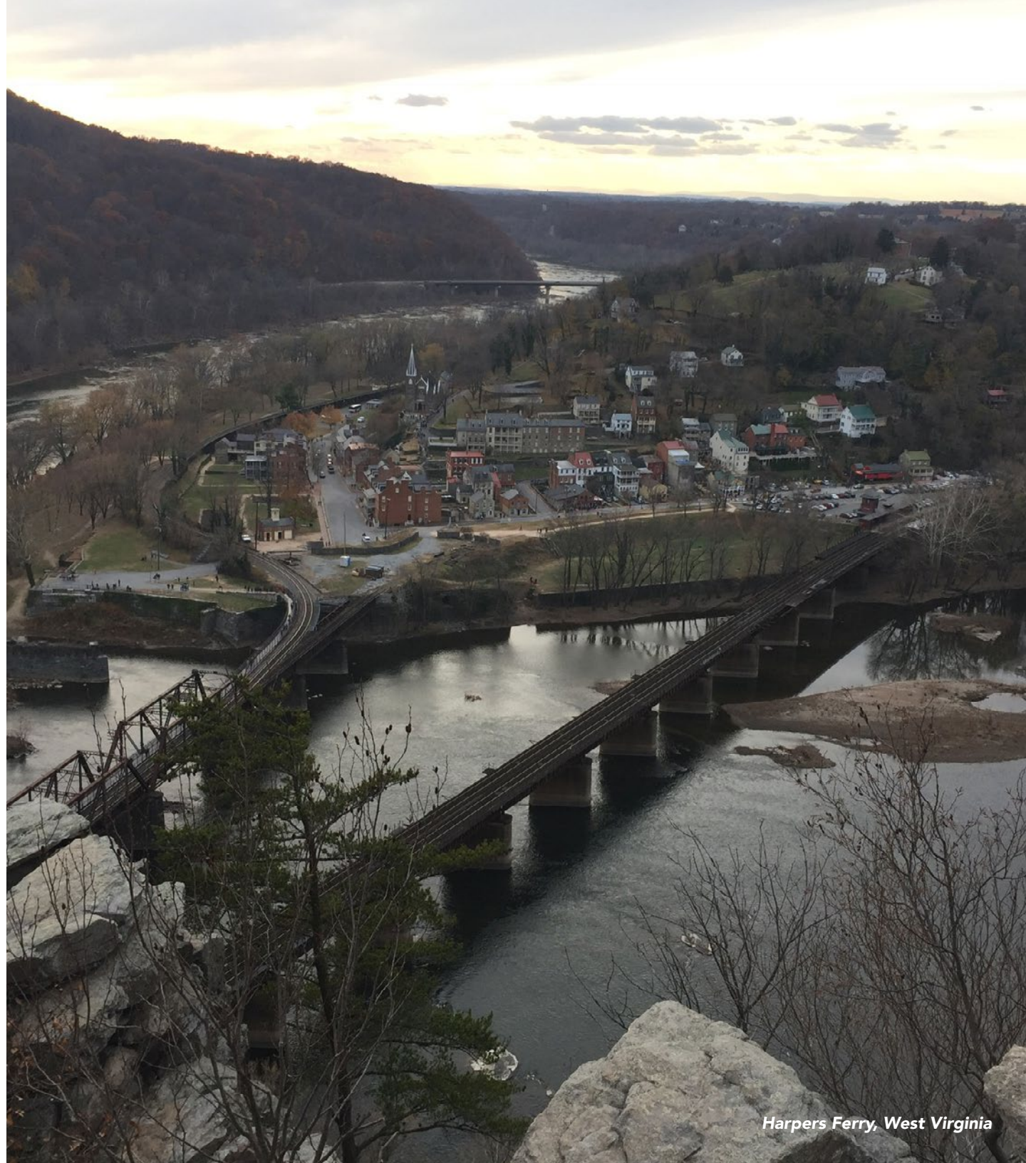
Harpers Ferry, West Virginia